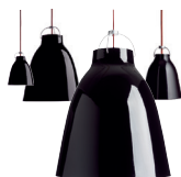
P0, P1, P3, P4 metal